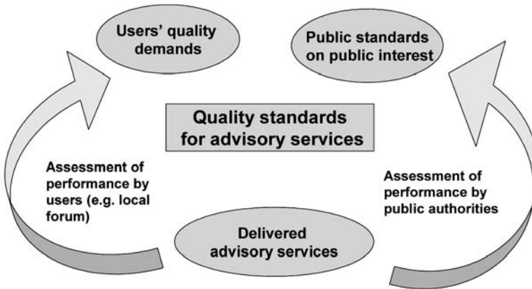
Figure 3 - Quality assurance in Demand Driven Agricultural advisory Services

Figure 3 shows how quality assessment should be handled differently according to whether private and/or public interests are involved: